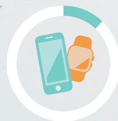
Tech and gadgets (12%)

Gen Z are the only generation that gives fashion and jewellery as their go-to Christmas gift and are least likely to give cash or gift cards.