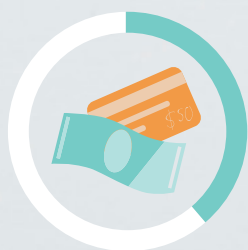
Cash or gift cards (31%)

The top three types of gifts given for Christmas are: