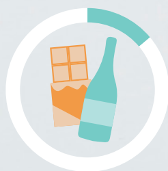
Food and alcohol (14%)